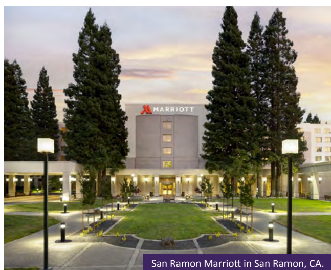
San Ramon Marriott in San Ramon, CA.

This year will be held at the San Ramon Marriott in San Ramon, CA. Located just 34 miles east of San Francisco, outdoor enthusiasts can enjoy hiking and biking trails, including short drives to Las Trampas Wilderness Regional Preserve, Sycamore Valley Open Space Regional Preserve, and Mount Diablo State Park. Mount Diablo, a towering presence north of San Ramon, is a place of great richness and significance to the valley Indigenous and other tribes who lived within sight of it.