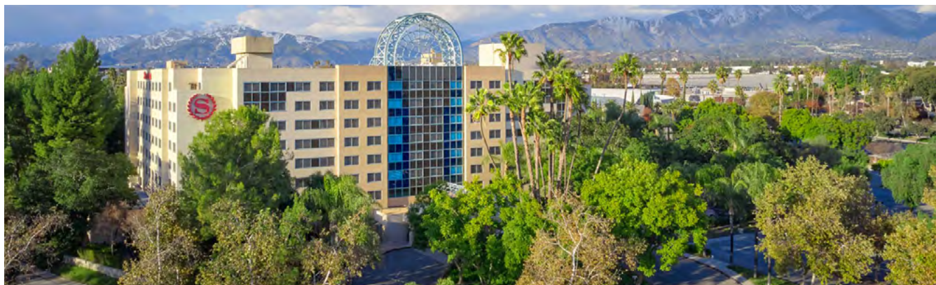
Sheraton Fairplex Suites & Conference Center in Pomona, CA.

California Trails & Greenways will be held at the Sheraton Fairplex Suites & Conference Center in Pomona, CA. A 20-minute drive from San Antonio Canyon of Angeles National Forest that offers excellent hiking and mountain biking trails. With a rich history, diverse population, thriving art scene, and top educational institutions, Pomona has something for everyone.