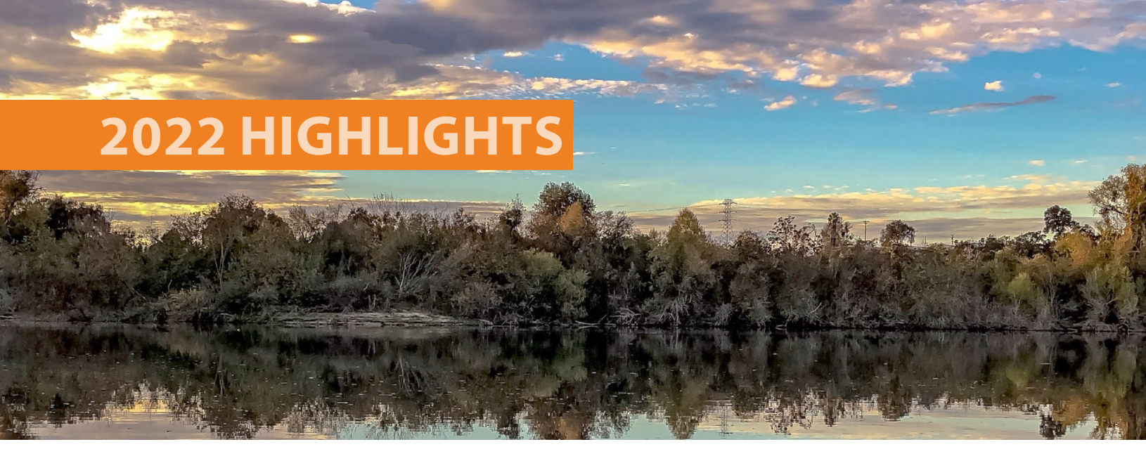
VIEW ALONG THE FOX TRAIL IN MODESTO, CA.

alifornia Trails & Greenways represents a singular opportunity to reach decision makers from the trails profession, including federal, state, local and regional recreation providers, non-profits, public and private land managers, policy makers, design and architecture firms, maintenance supervisors, builders, equipment operators and manufacturers, interpreters and environmental educators, software developers and many more.